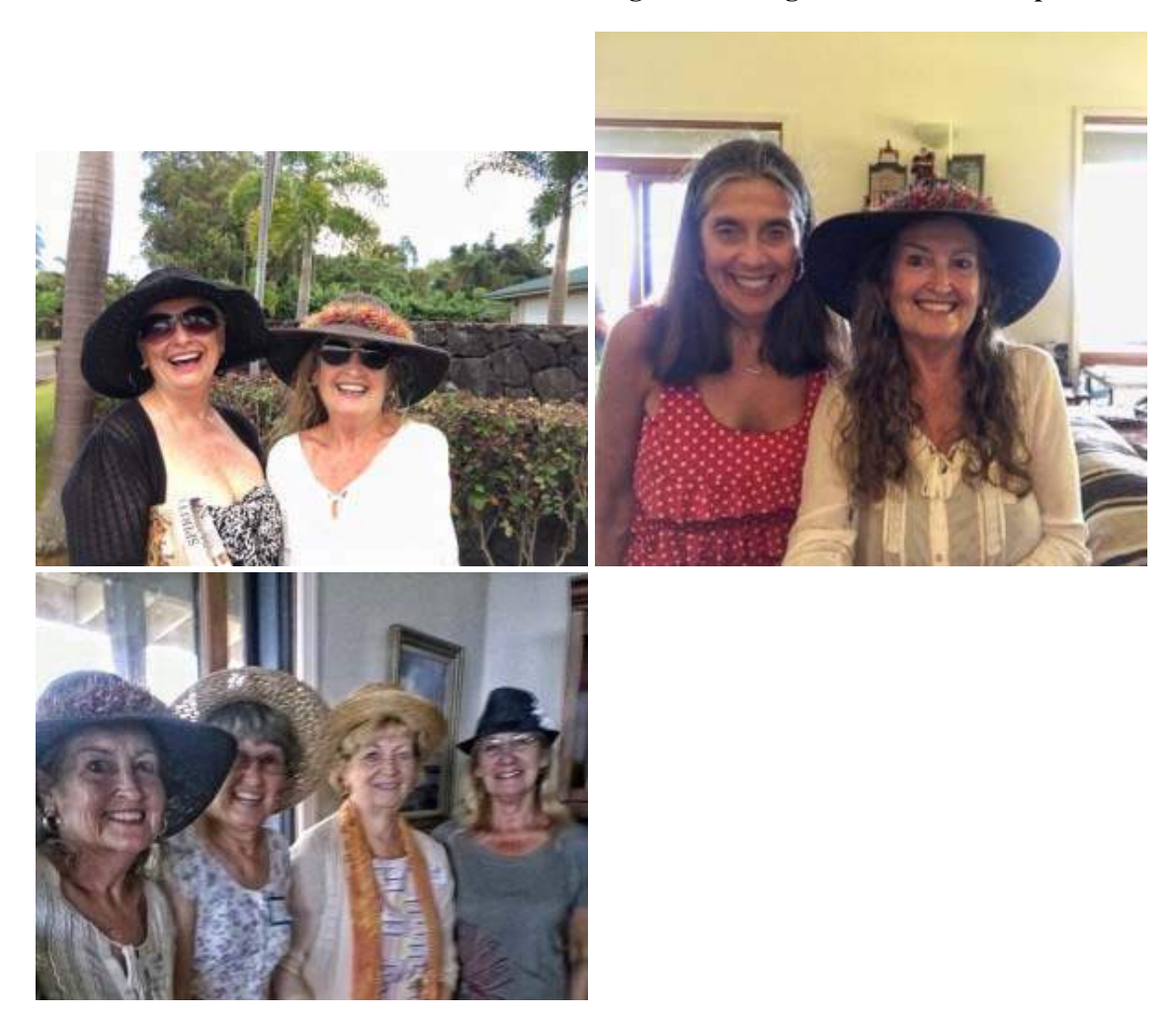
About Patsy Mink Ahead of the Majority Film screening / Panel Discussion 3/30/16

Successful fundraiser in a Bucolic setting overlooking the ocean and the pastures.