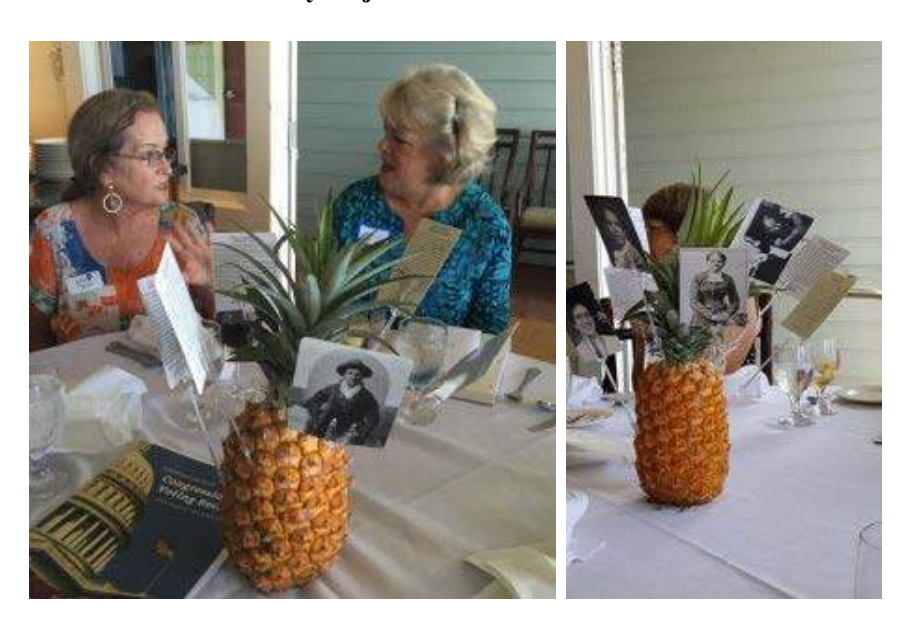
Centerpieces with cards showing Famous American Women to Emulate