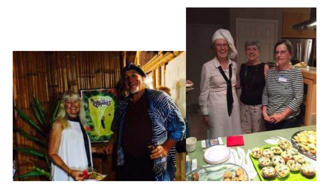
Pupus/ Main Meal/ Dessert at the homes of three members, who reside in walking distance of each other.