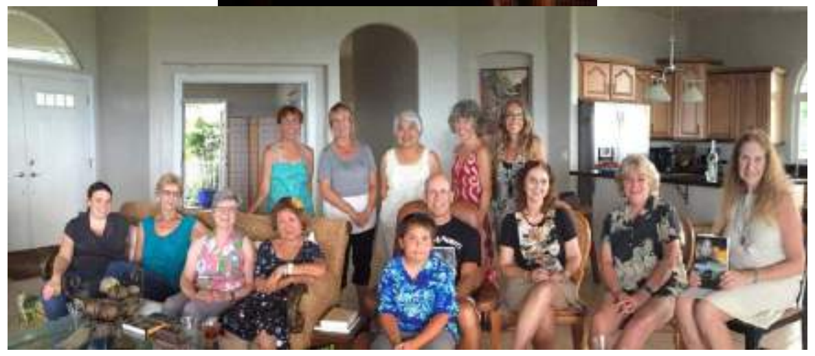
6/20/15 KALOPA HIKE